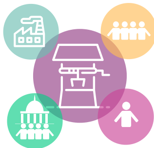
Shared or communal facilities