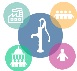
Individual on-site solutions