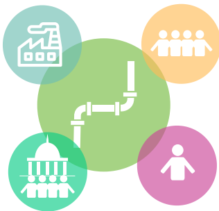
Connection to a piped network