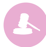
Legislation, policies and regulatory frameworks